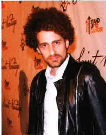
Actor Isaac Kappy

Actor Isaac Kappy died Monday near Flagstaff.