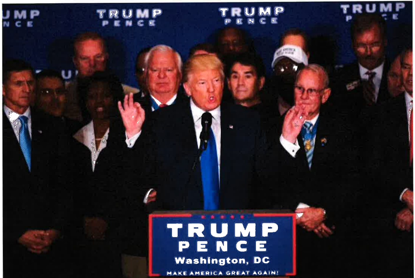
Then-Republican presidential candidate Donald Trump states that he believes President Barack Obama was born in the United States.