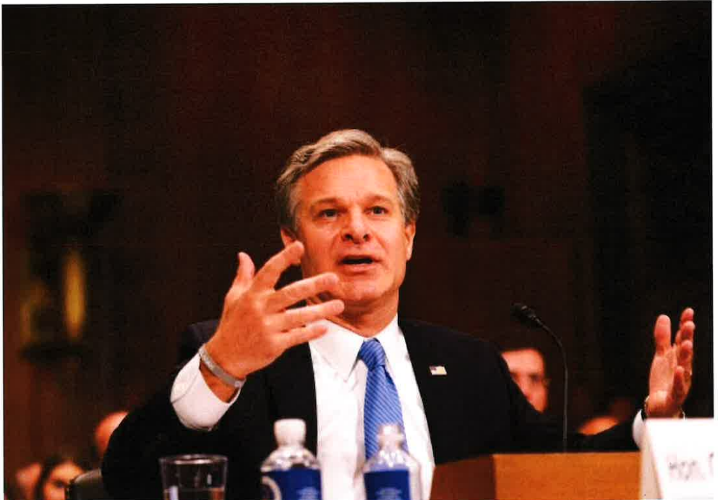
FBI Director Christopher Wray testifies before a Senate Judiciary Committee hearing.

The new focus on conspiracy theorists appears to fall under the broader category of anti-government extremism. “This is the first FBI product examining the threat from conspiracy theory-driven domestic extremists and provides a baseline for future intelligence products,” the document states.